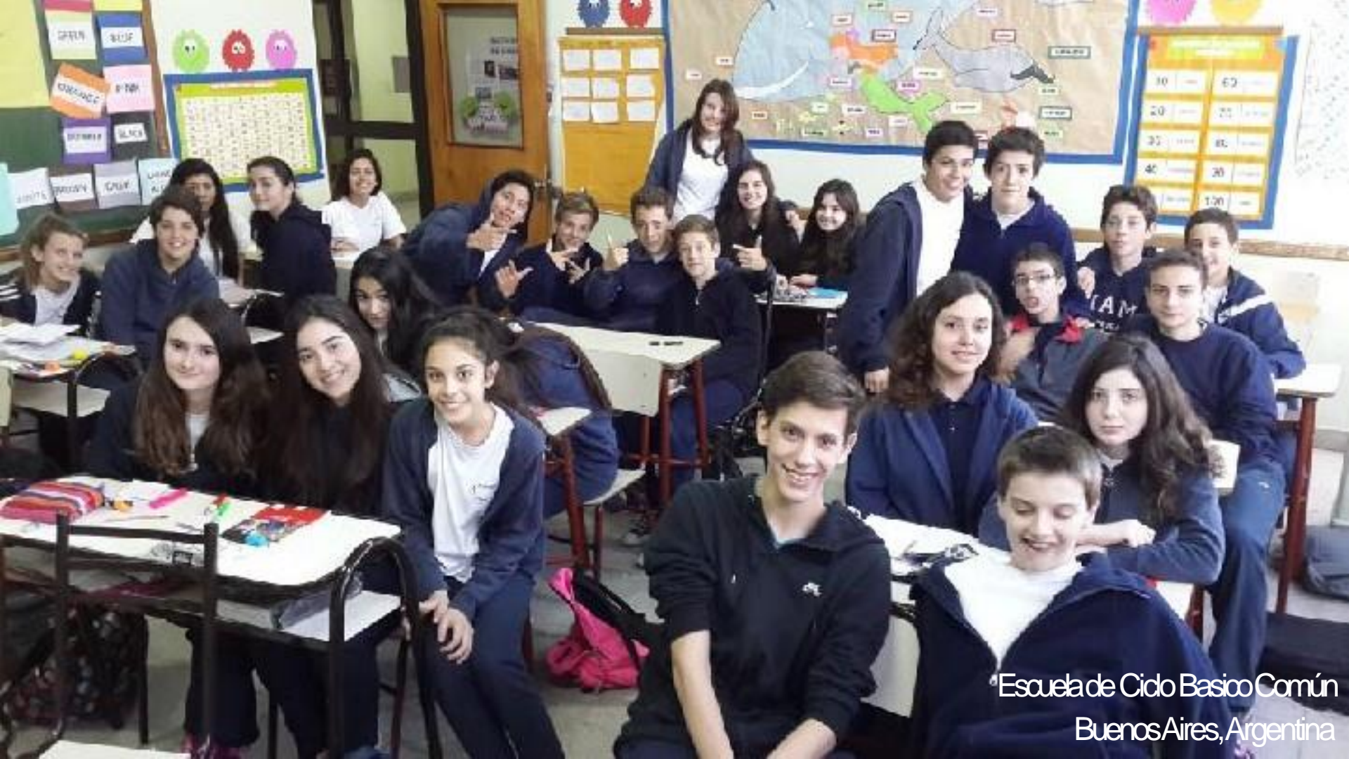
Escuela de Cido Basico Común Buenos Aires, Argentina