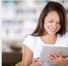
Continuing professional development