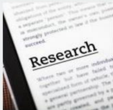
ELT research database