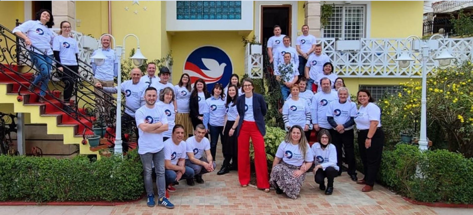
The PCAM Full Time Staff