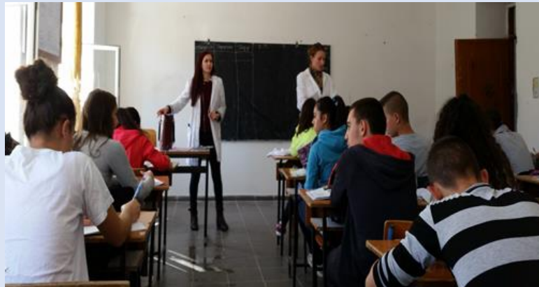
Peace Corps Volunteer teacher and her counterpart

Develop teaching and learning capacities in English language (In Albania and in Montenegro)